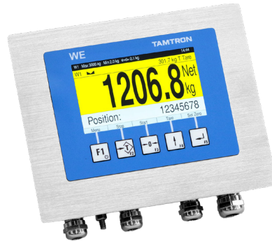
PANEL-MOUNT VERSION Stainless steel housing for installation in cut-out of switch cabinet