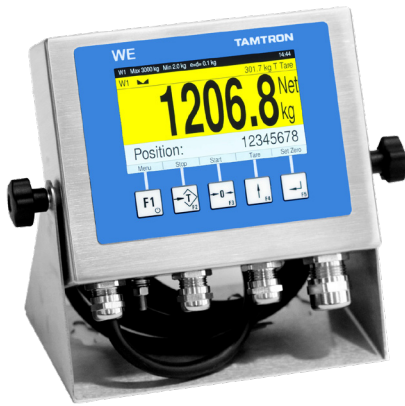
WALL/DESK VERSION Stainless steel housing for wall and desk-top installation